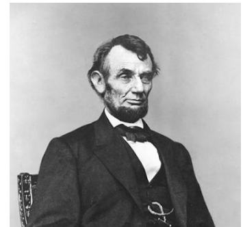
President Abraham Lincoln

Absentee voting began to have more of an impact during the Civil War, however. President Abraham Lincoln was running for reelection after more than three years of war. His opponent in the general election was General George B. McClellan, former Commanding General of the Union Army. Approximately 1,000,000 Union soldiers were away from home serving in the military in 1864. It was obvious that most of them could not all return home to vote in the election.